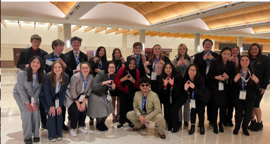
DECA students honed their business skills at the State Competition